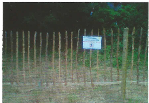
Example of fenced exclusion zone

Badgers are a protected species, and certain measures must be taken to ensure that lawful activities taking place near badger setts are carried out within the law. With appropriate measures and advanced planning, badgers can remain protected and unharmed during the course of development activities. If you are undertaking any activities and require advice please contact the Badger Trust at staff@badgertrust.org.uk .