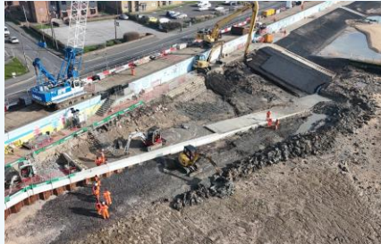
Completed sheet pile capping beam and construction of beach access ramp at Concord Beach