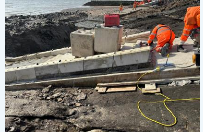
Construction of final precast concrete beach access steps