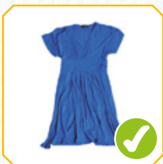
Dresses & skirts