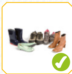
Shoes & boots