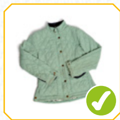
Coats & Jackets