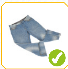
Trousers & Jeans