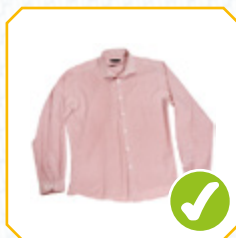
Shirts & blouses