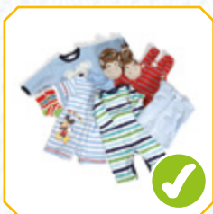
Baby & children's