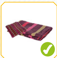
Bedding & curtains