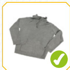
Jumpers & t-shirts